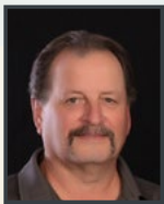
Manager of Operations

Another round of storms hit again and caused some damage to some of our transmission structures east of the Cerro Gordo Town Hall on July 9 th . This affected Watson and Madison Substations around 9 p.m. Other than the transmission, which was back fed to allow for the repairs to be made, there were very few individual outages. Then around 10 p.m. that same evening, there was excessive lightning in the Vallery, Wood Lake and Echo area, which caused an interruption on the transmission line. This line also caused a 15 minute outage out of the Lisbon Substation. We thank you for your patience when these events occur. These outages were mainly caused by the wind and lightning. Last month's outages had to do a lot with trees and branches getting in the power lines. If you happen to notice a potential problem with trees and/or branches, we would appreciate a call so we can take care of them.