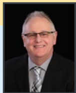
Member Services Manager